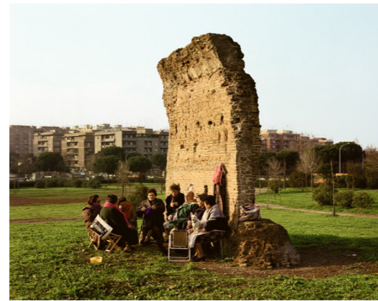
Joel Sternfeld, Woman at their daily gathering beside an ancient roman wall ; 1990.