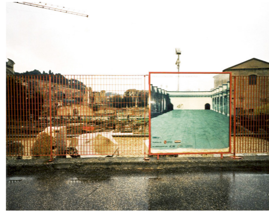
Armin Linke, The Roman City Project ; 1999.