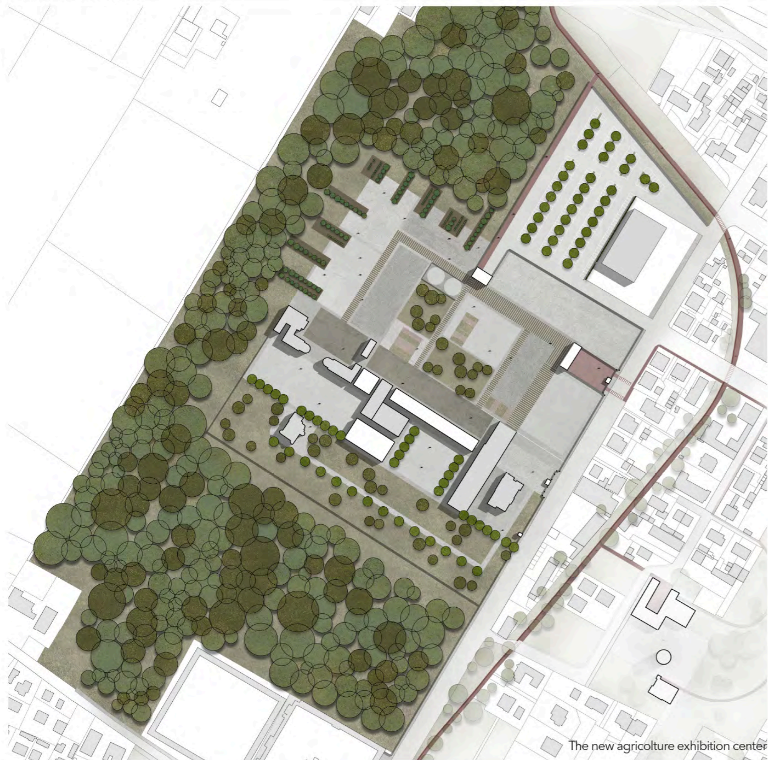
The new agriculture exhibition center