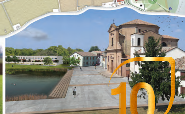
Quattrelle new Public Square