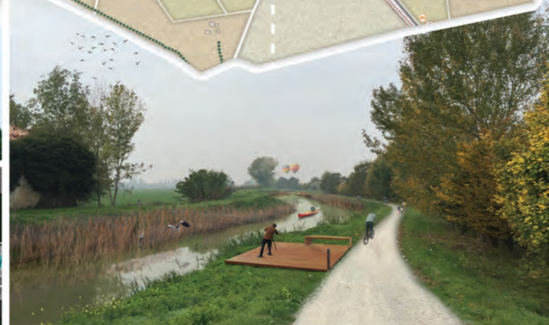
Fossalta Eco museum