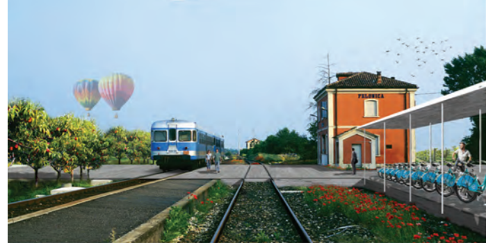
Train station - Bike sharing