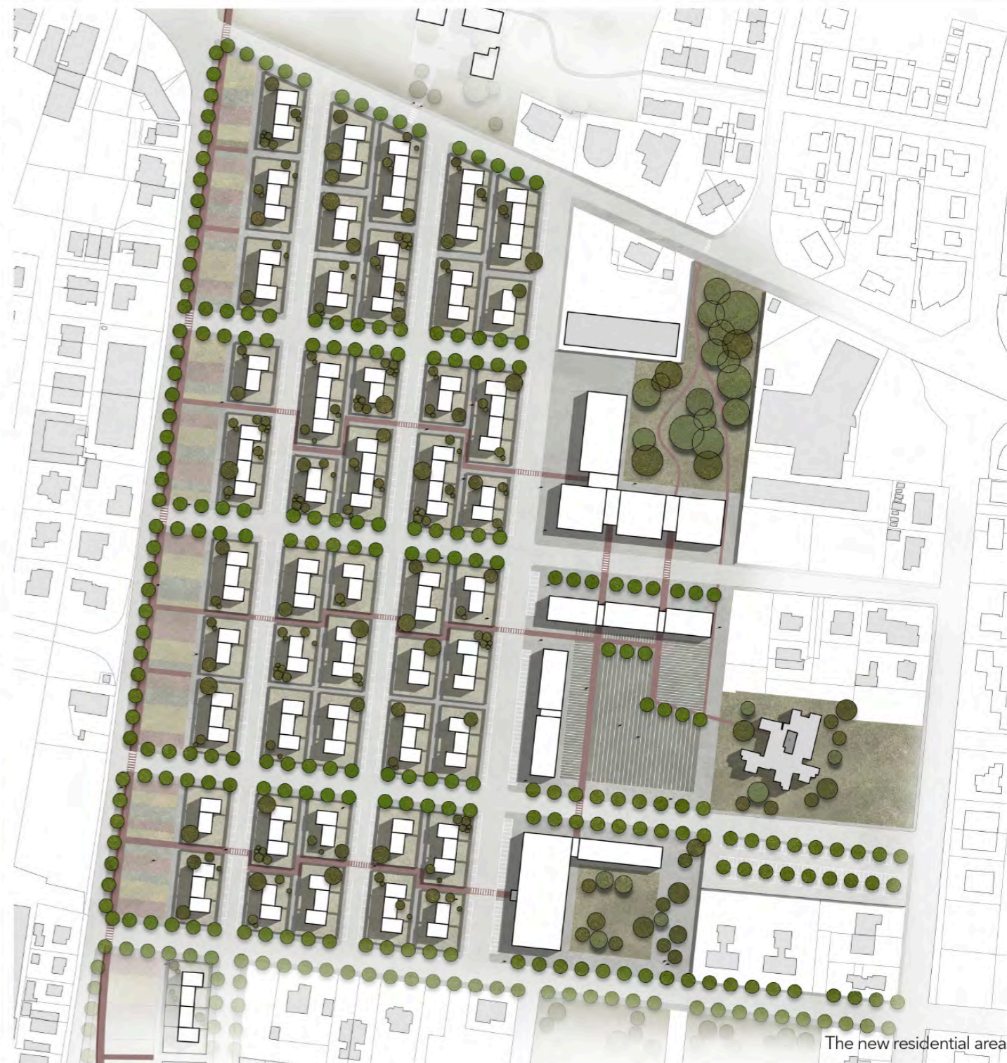
The new residential area