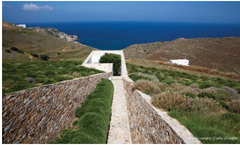
Cohabitation landscapes Athens (Greece) DOXIADIS+

https://landscape.coac.net/new-turenscape-project