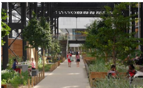
Halle Pajol, garden Rosa Luxemburg Paris (France) InSiTU

https://landscape.coac.net/jiahe-river-country-park-response-urban-flood-risk