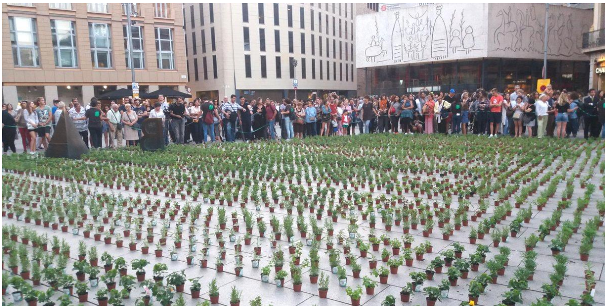
POP UP GREEN 2016

https://landscape.coac.net/sites/default/files/MANIFIESTO_ENG.pdf