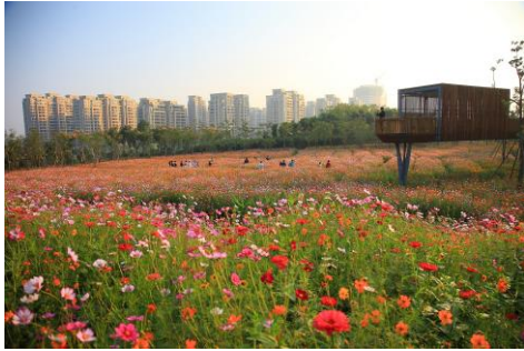
Performative and Transformative: Quzhou Luming Park Beijing (China) Turenscape

https://landscape.coac.net/new-turenscape-project