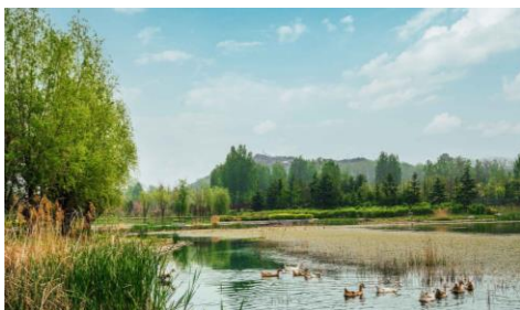
Proposal by Jiahe River Country Park at the risk of urban flooding Haidian District (China) Beijin Forestry University

https://landscape.coac.net/san-michele-museo-allaperto-sul-carso-goriziano