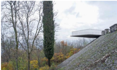
Outdoor Museum of San Michele in Gorizia Karst Camorino (Italy) Studio Paolo Bürgi

https://landscape.coac.net/paisajes-de-cohabitacion