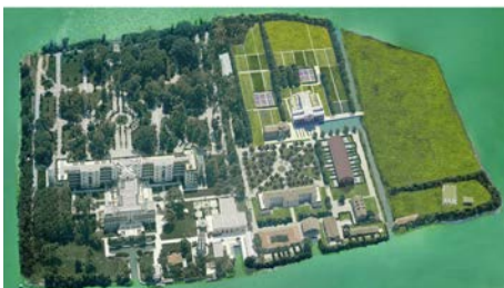
Open spaces and project of the historical park of Sacca Sessola Venice (Italy) CZ Studio associati

https://landscape.coac.net/remodelacion-del-paseo-maritimo-de-tel-aviv