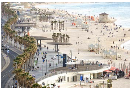
Remodeling of the Tel Aviv seafront promenade Tel Aviv (Israel) Mayslits Kassif Architects

https://landscape.coac.net/remodelacion-del-paseo-maritimo-de-tel-aviv