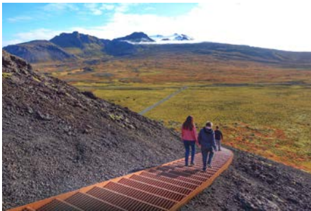
Saxhóll crater ladder Reykjavík (Iceland) Landslag ehf

https://landscape.coac.net/parque-lineal-ferrocarril-de-cuernavaca