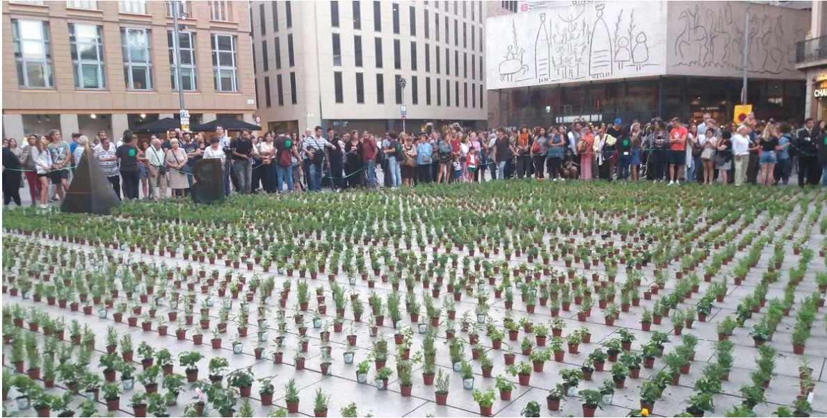
POP UP GREEN 2016

https://landscape.coac.net/sites/default/files/MANIFIESTO_ENG.pdf