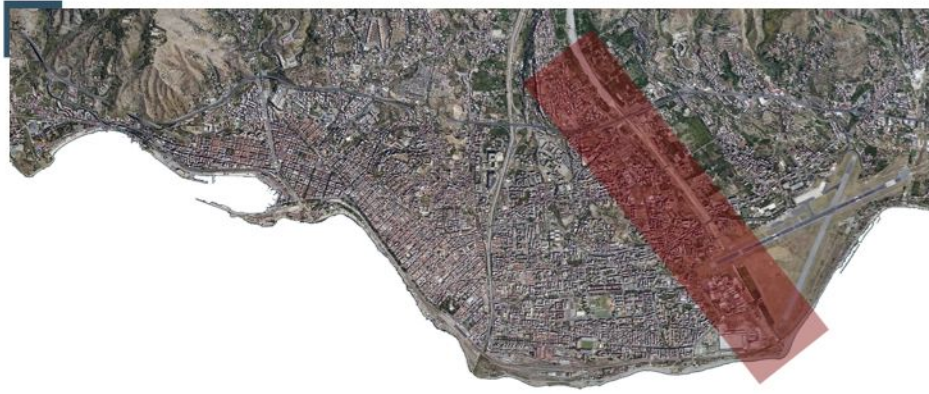
Reggio Calabria, Italy