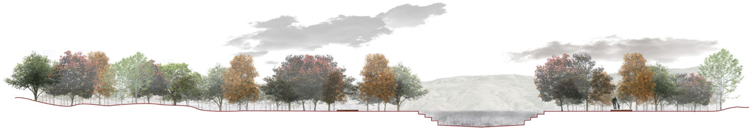
Rendering of the project