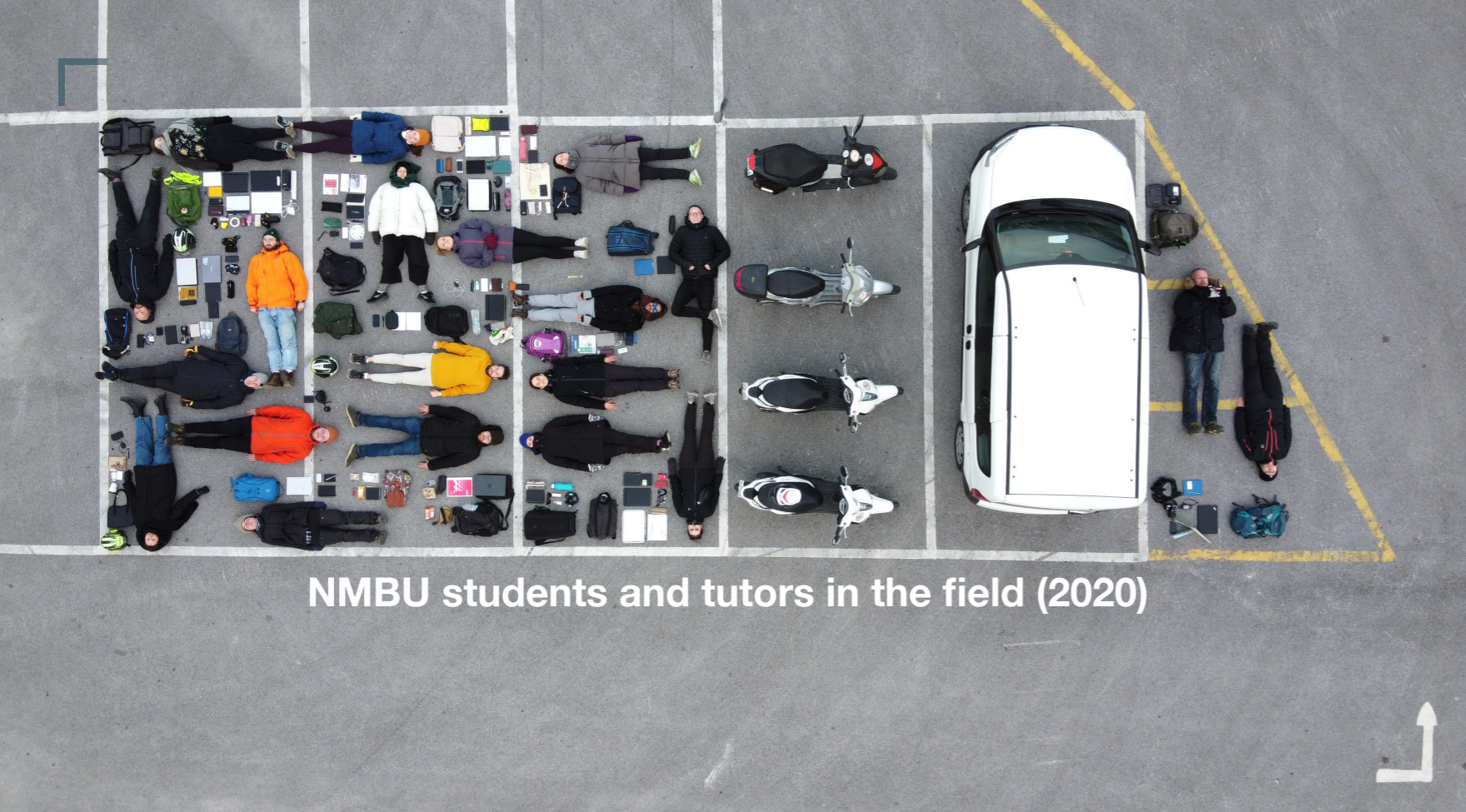
NMBU students and tutors in the field (2020)