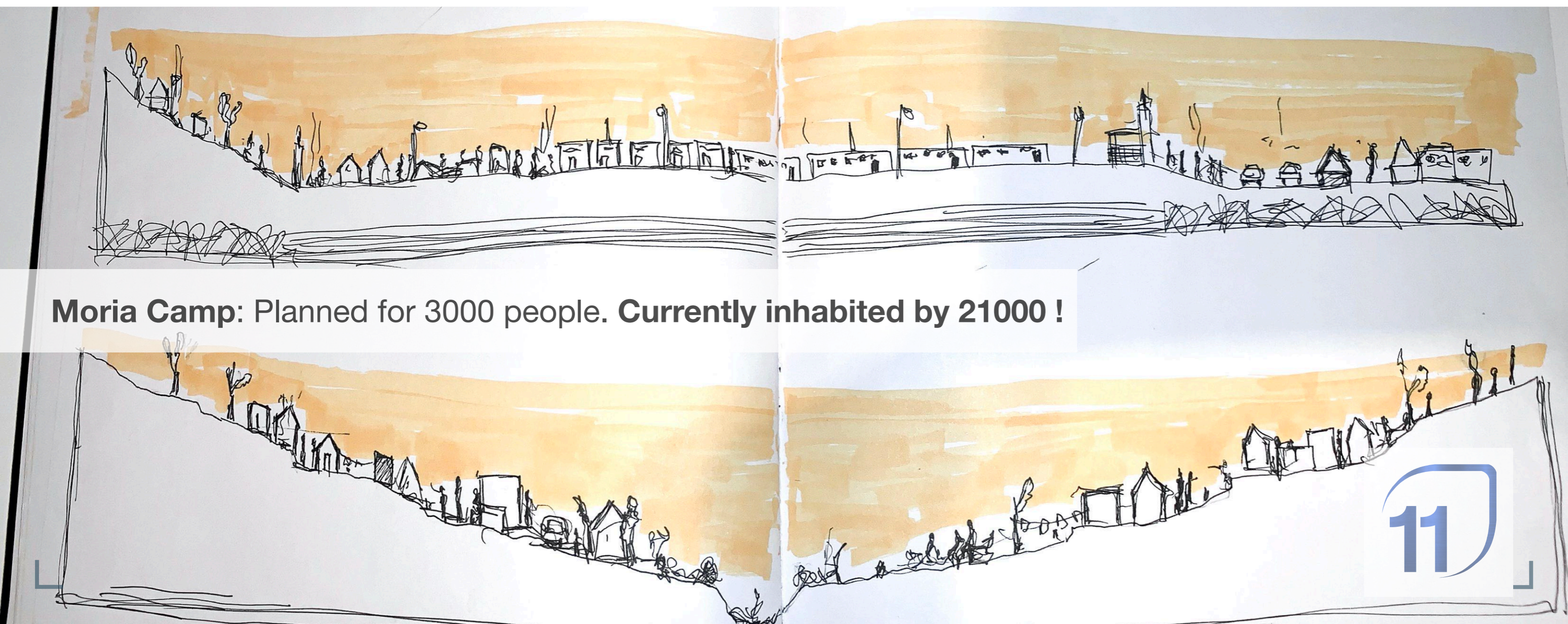
Moria Camp: Planned for 3000 people. Currently inhabited by 21000 !