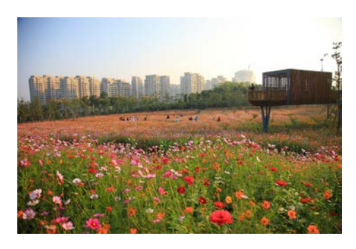
Performative and Transformative: Quzhou Luming Park Beijing (China) Turenscape

https://landscape.coac.net/new-turenscape-project