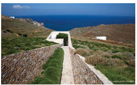
Cohabitation landscapes Athens (Greece) DOXIADIS+

https://landscape.coac.net/new-turenscape-project