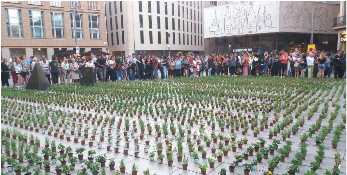
POP UP GREEN 2016

You can download the manifesto in the following link: https://landscape.coac.net/sites/default/files/MANIFIESTO_ENG.pdf