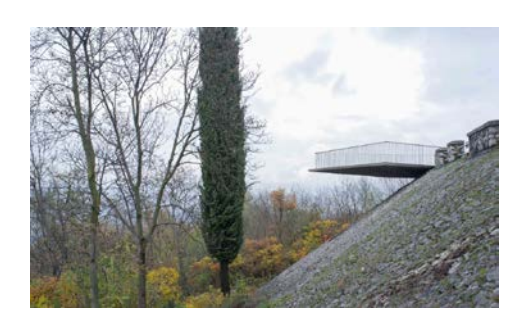
Outdoor Museum of San Michele in Gorizia Karst

https://landscape.coac.net/paisajes-decohabitacion