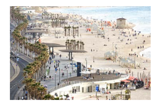
Remodeling of the Tel Aviv seafront promenade Tel Aviv (Israel) Mayslits Kassif Architects

https://landscape.coac.net/remodelacion-delpaseo-maritimo-de-tel-aviv