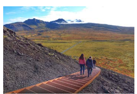
Saxhóll crater ladder Reykjavík (Iceland) Landslag ehf

https://landscape.coac.net/parque-lineal-ferrocarril-de-cuernavaca