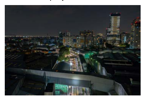
Linear Park, Cuernavaca Railway Ciudad de México (Mexico) Gaeta-Springall Arquitectos

https://landscape.coac.net/parque-lineal-ferrocarril-de-cuernavaca