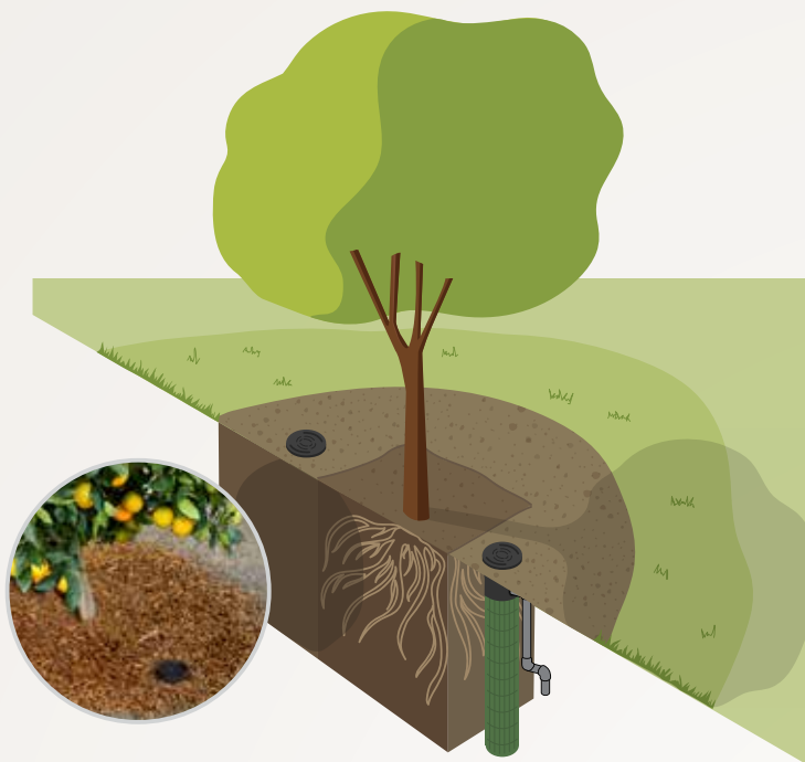
Root Zone Watering System

RZWS can be turned off or modified with pop-up spray heads to apply adequate water for maturing trees.