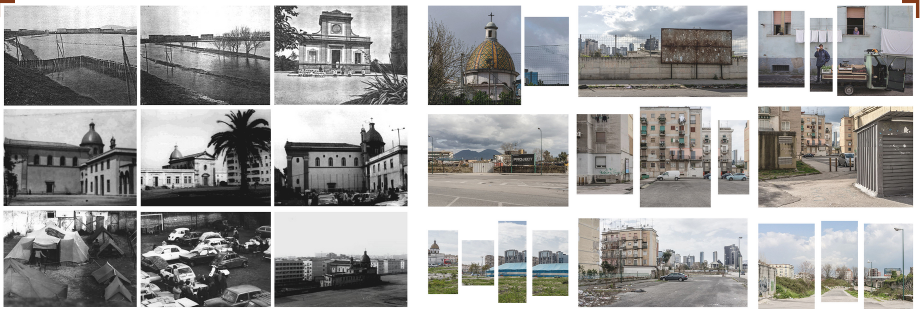
il rione luzzatti tra ieri e oggi