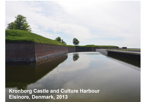
Kronborg Castle and Culture Harbour Elsinore, Denmark, 2013

Renovation and innovation of the areas around Kronborg Castle ( UNESCO World Heritage site ) and Kulturhavn Kronborg are quite special. You walk around with the feeling that nothing could be different. The place has an inner power and balance that characterizes a master's work. Kronborg has not been packed but lies as it is heading for Øresund and the harbor has with a few strong grips regained the balance and cohesion with the city of Elsinore.